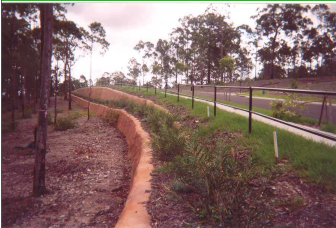
SPLIT E WALL – Northlakes Sub-Division Newcastle, NSW