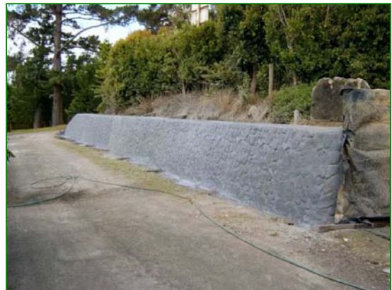
Stencilled Face, New Zealand