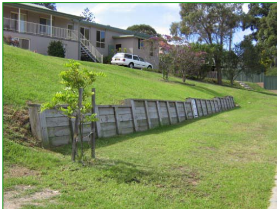
Closed Timber Face, Glendale