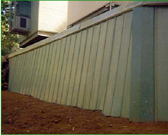
Colourbond/Steel Panels Nabiac