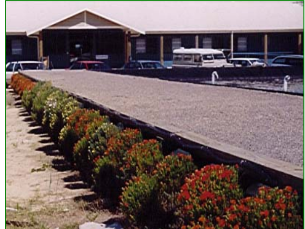
Shadecloth & Plants Pt Stephens