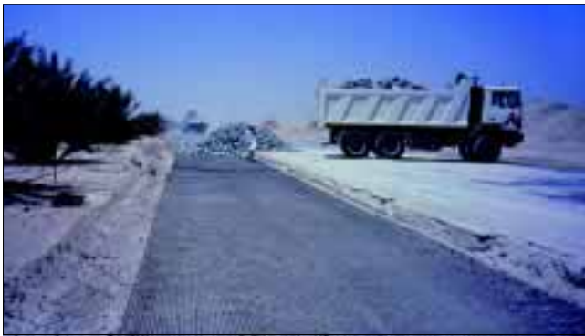
TENAX Geogrids are designed to interlock with large aggregate rock fill and do not suffer construction damage.

For the slip roads TENAX LBO 303 SAMP geogrids were installed for the full width of the new road base, back filled and compacted with the special rock fill. In total, in excess of 700,000 m 2 of TENAX LBO 303 SAMP geogrids were installed on the project.