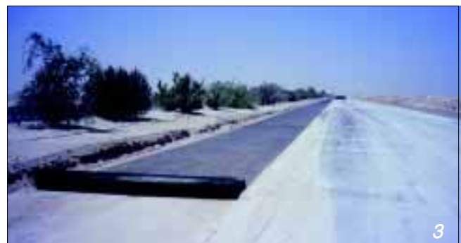
Fig. 1: Geogrid layers during rock fill operation. The overall project required 700.000 m 2 of TENAX LBO 303 SAMP bioriented geogrids.