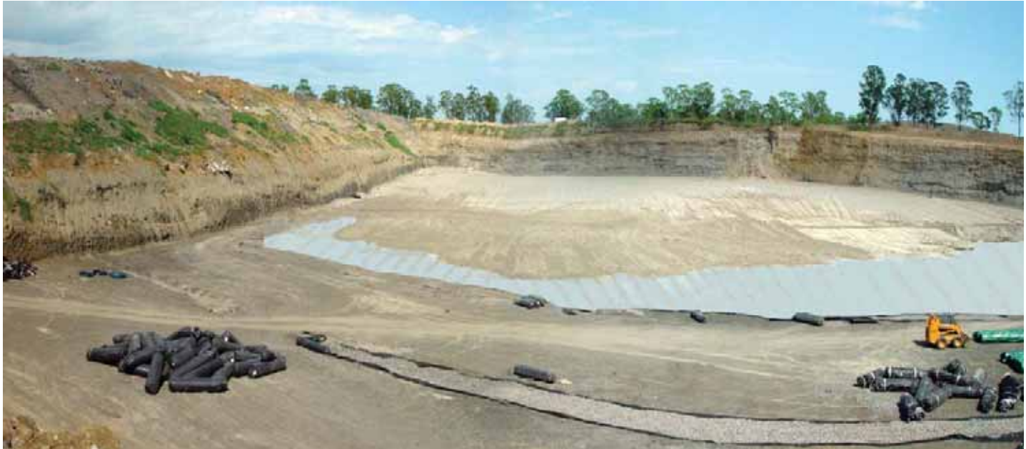
Marsden Park Stage 2