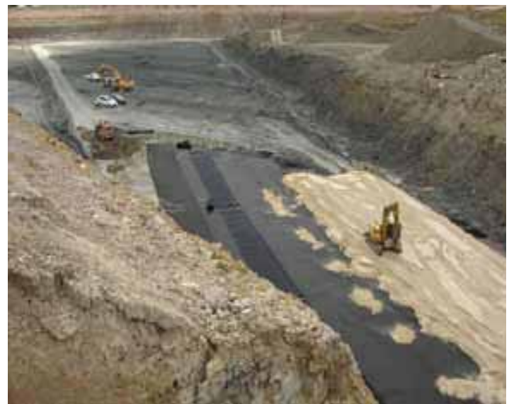
Marsden Park Stage 1

This case history reviews the work carried out to determine that the TenDrain GNT 2200 tri-planar geonet drain added to a 330 g/m 2 nonwoven geotextile, was equivalent to a gravel drainage layer.